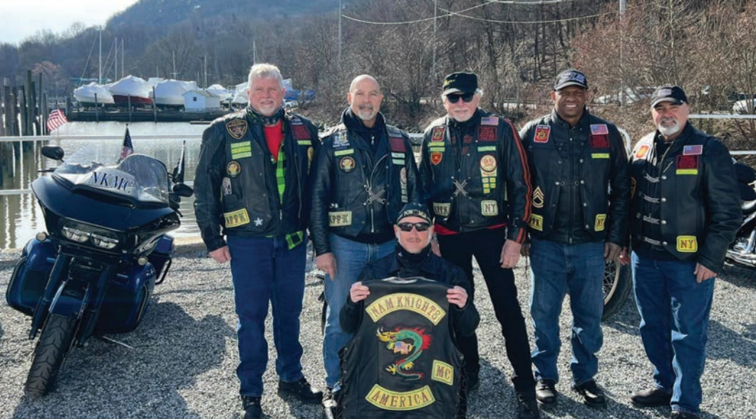
Nam Knights of America Motorcycle Club, Orange County Chapter Members