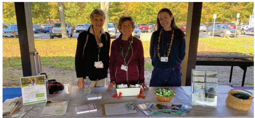
Town of Newburgh Senior Wellness Fair

Volunteers also help by working tables at community events to answer questions about our services.