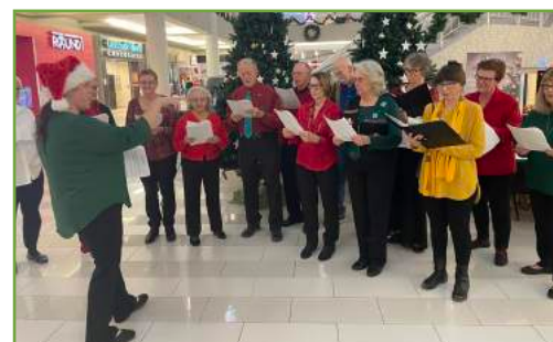
Middletown Concert Chorale Performing at the Galleria at Crystal Run