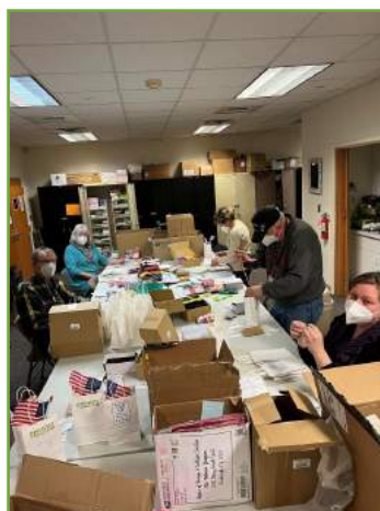
Hospice personnel, volunteers, and Veteran volunteers assembled packages to be delivered to Veterans in nursing homes throughout Orange and Sullivan Counties for National Salute to Veteran Patients Week