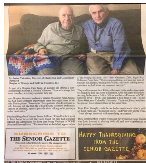
Hospice Veteran Volunteer Story