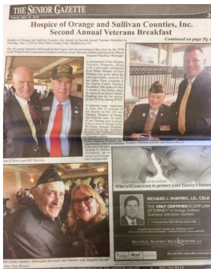
Second Annual Veterans Breakfast

https://www.newsbreak.com/new-york/new-hamburg/daily-news/2019/05/27?s=ws_em