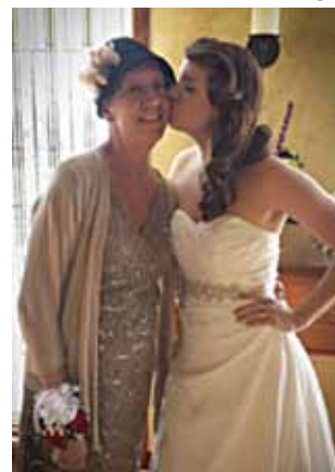
Mother and Bride.