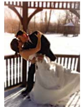
Bride & Groom.