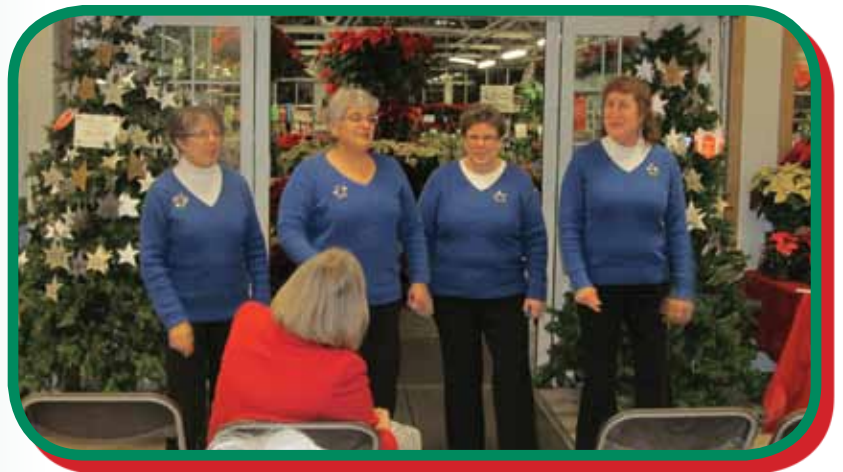
After Hours Quartet

Barton Birks Chevrolet Cadillac Chester Printing Crystal Run Healthcare, LLP Mr. Willy's Orange and Rockland Utilities Willcare, Inc.